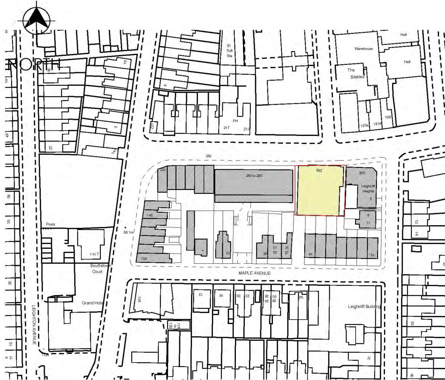
1 Existing Site Location Plan