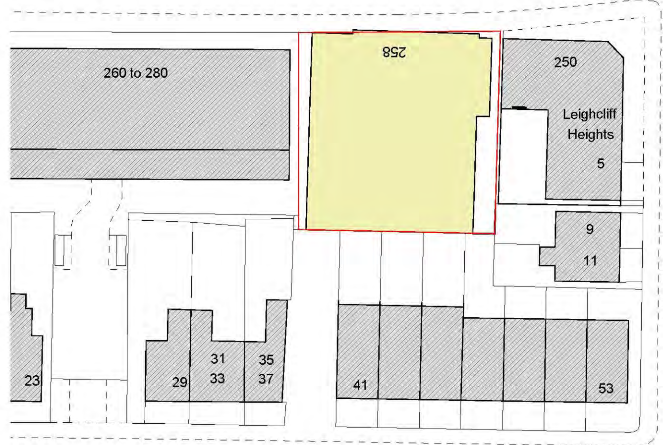
2 Existing Site Plan